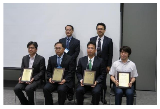
Recipients of the Certificates