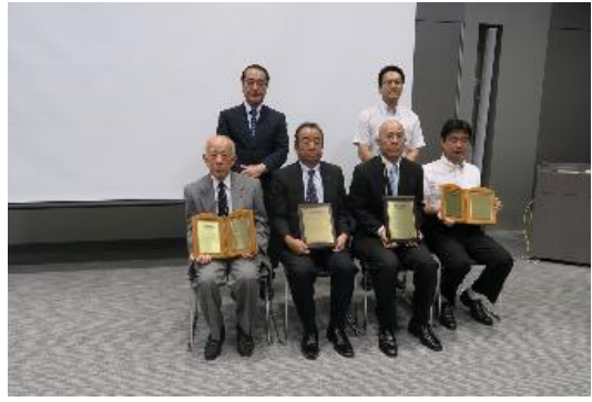
Recipients of the Certificates