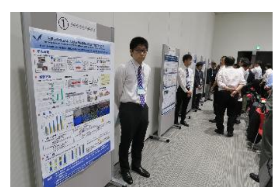
Q & A Session at the Posters