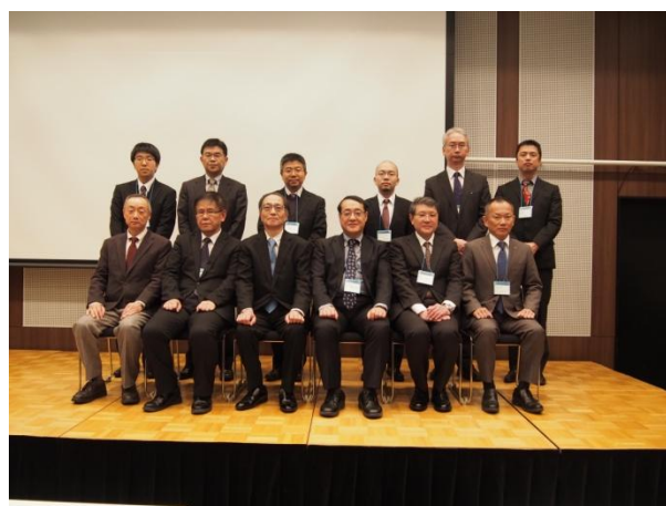
Winners of the Prizes