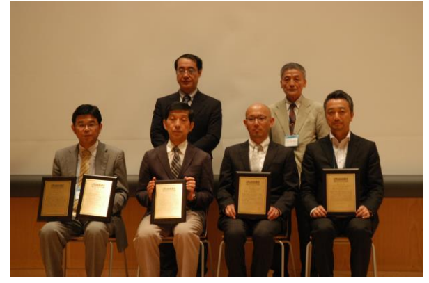
Recipients of the Certificates