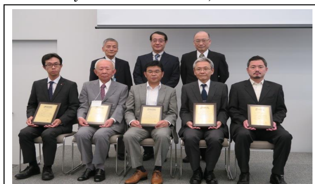
Recipients of the Certificates