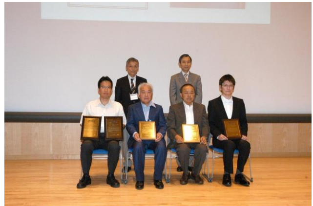
Recipients of the Certificates